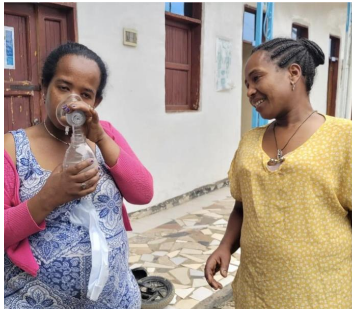
Atse is demonstrating resuscitation skills by trying to fit a paediatric mask on herself to size bag-valve-masks correctly.