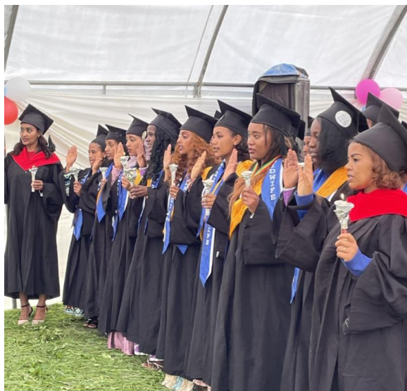
Hamlin midwife graduates swear the midwives' oath.