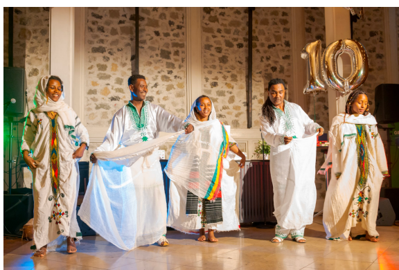
Traditional Ethiopian dance group Ethio Hager Fiker