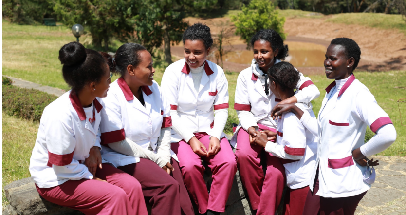
Midwifery students at the Hamlin Collage of Midwives